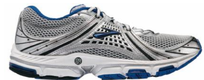
Brooks Trance™ 8 (Men's)