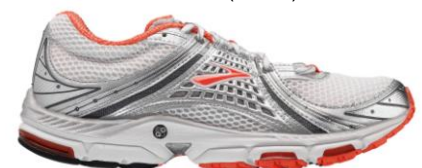
Brooks Trance™ 8 (Women's)

Please visit Brooks Sports' “Green Room” at www.brooksrunning.com/greenroom for additional information about BioMoGo and other social responsibility and environmental stewardship programs from Brooks.